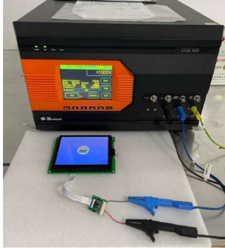
3.2 群脉冲测试图 EFT test

the performance is in line with the criteria GB/T 17626.2 B level and above.