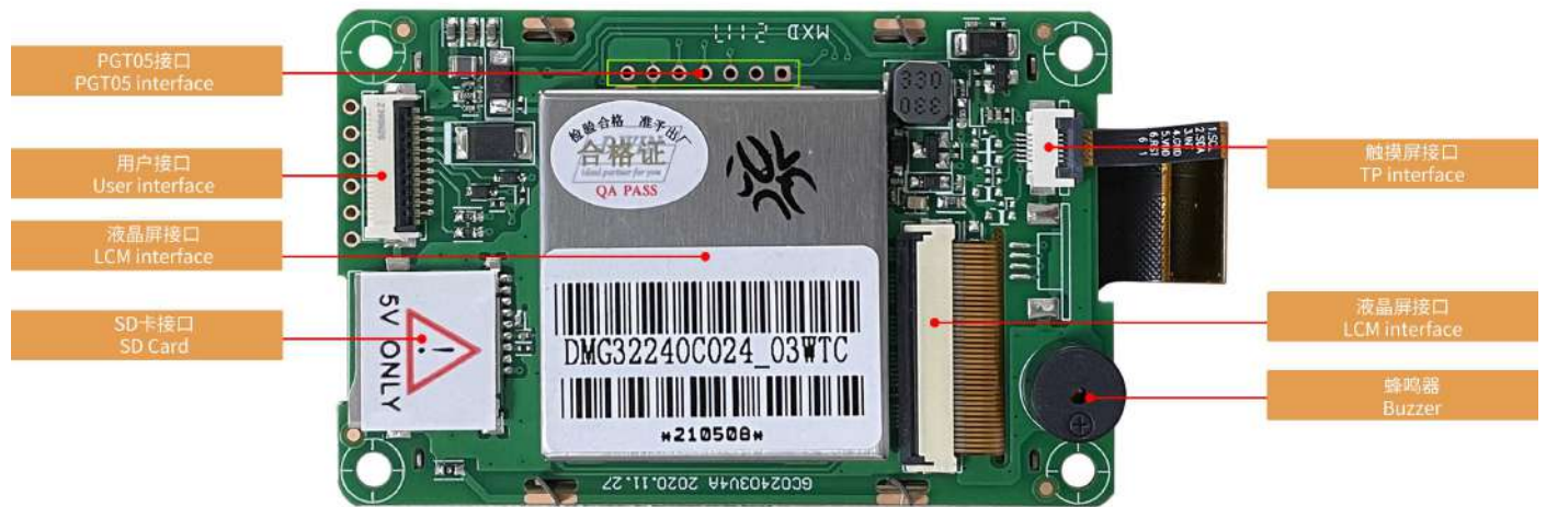
硬件接口图 Hardware interface