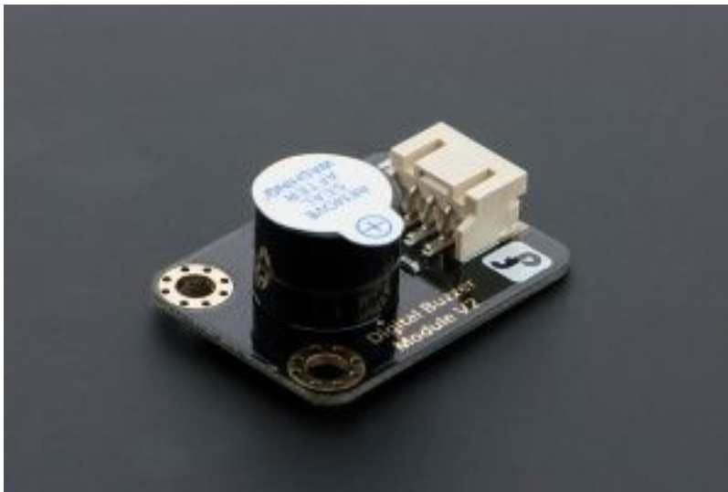
Digital Buzzer Module V2