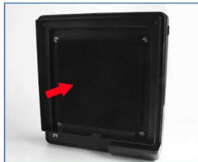
2. Put in the activated carbon filter