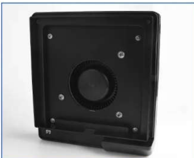
1. Open the filter protection cover