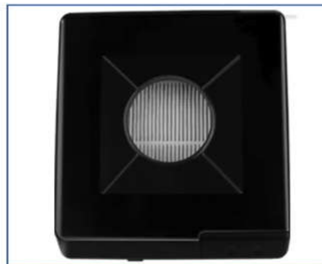
4. Close the filter guard