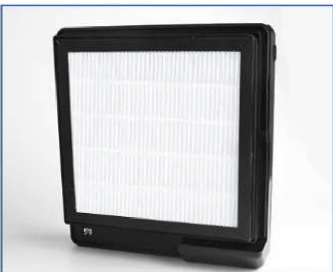
3. Put in the dust collection filter